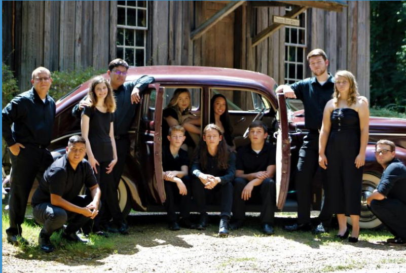
Congratulations, GCPAA Class of 2020!!!